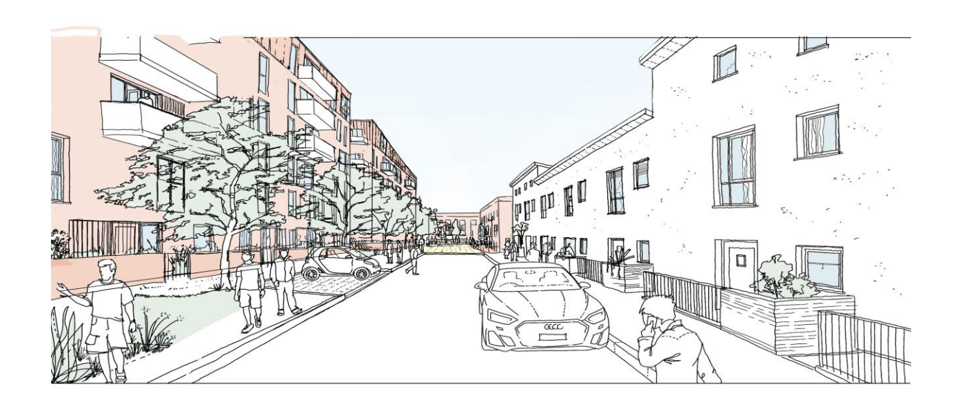
North South View from Lordship Lane